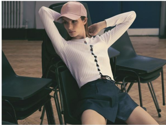
Top, £49 (sizes 6-14), TopsShop Skirt, £55 (sizes 4-18), Cap, £10, both ASOS

PHOTOGRAPHY: SRAMUS MCGUINNESS FASHION: KATE ANDREWS