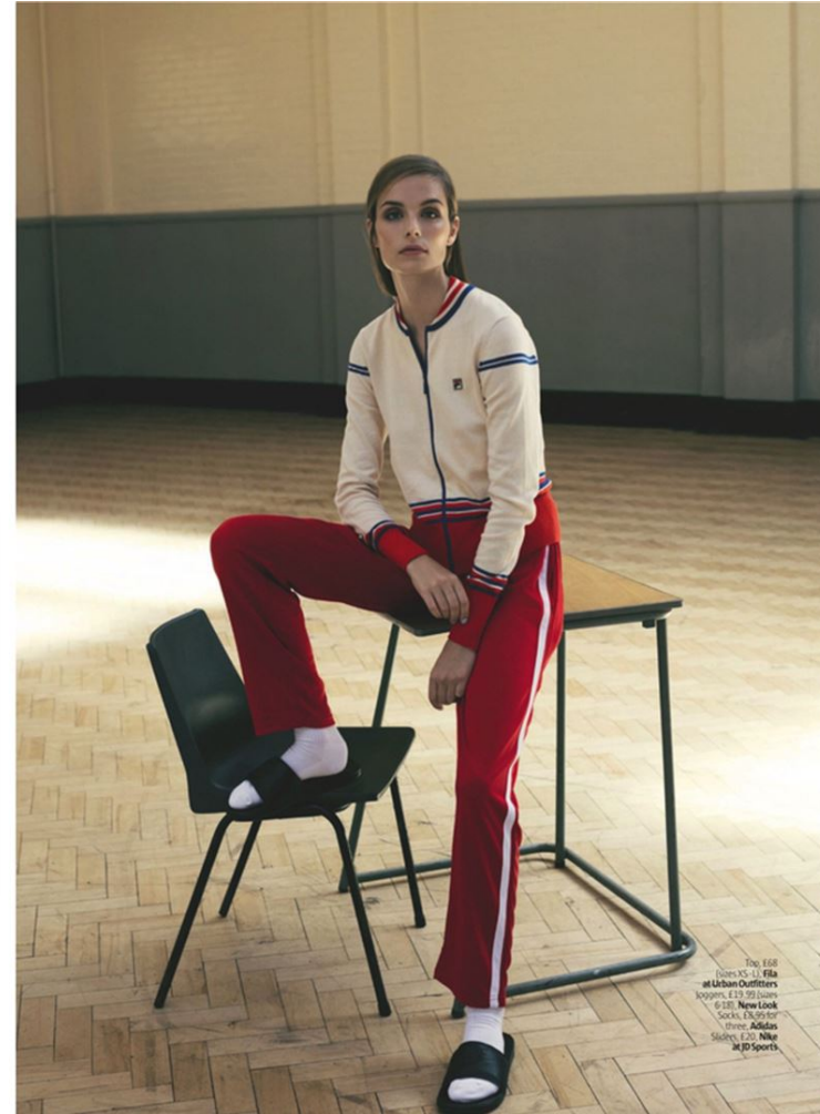
Top, £68 Sizes XS-XL, £84 at Urban Outfitters Joggers, £17.99 (sizes 4-18), New Look Socks, £3.99 for three, ASOS Sliders, £20, Nike at JD Sports